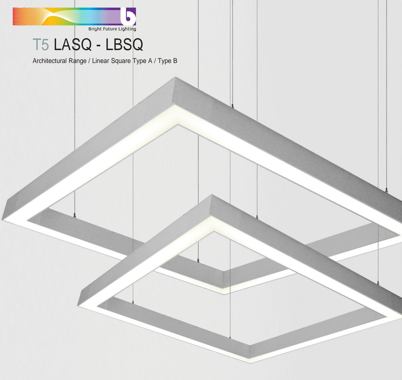
*Special sizes can be made on request. Please contact a member of the sales department